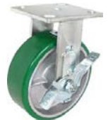
5" X 2" Rigid Caster poly on cast iron wheel w/ top lk brake