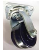
5" X 2" Swivel Caster phenolic wheel.