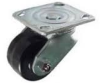
3.25" X 2" Low Profile Swivel Caster with phenolic wheel