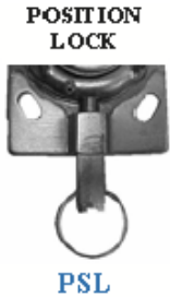
Welded on 4 Position Swivel Lock adds $8.00 per swivel caster.