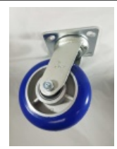
5" X 2" Swivel Caster with round tread poly wheel