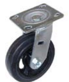
5" X 2" Swivel Caster rubber on cast iron wheel