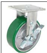
8" X 2" Rigid Caster poly on cast iron wheel w/ top lk brake