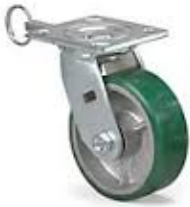
Swivel Caster with welded on 4 Position Swivel Lock: Adds $8.00 each to swivel caster price.

High load capacity with quiet rolling capability. 95 Shore A Durometer