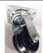
4" X 2" Swivel Caster phenolic wheel.