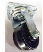
8" X 2" Swivel Caster phenolic wheel.