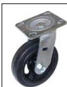
8" X 2" Swivel Caster rubber on cast iron wheel